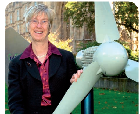
Small wind turbines can generate clean electricity at home

I have been campaigning hard to make sure the Code sets tough standards so the impact of new houses on the local environment is minimised. At a meeting with the Prime Minister I urged him to make the Code mandatory across all building sectors; for new office buildings as well as social and private housing. The Select Committee I chair is currently scrutinising government policy on housing.