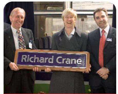
Dr Starkey at MK Central for

I continue to campaign for the re-opening of the East-West rail link from Oxford to Bletchley. The final